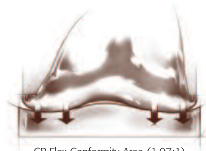
CR-Flex Conformity Area (1.07:1)

The intercondylar geometry is identical to NexGen CR with current NexGen CR patellar instrumentation and implants.